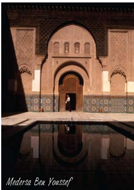
Medersa Ben Youssef

We then took a cookery class with the head chef and learnt how to prepare a delicious fish tagine. The superb and extensive menu changes daily at the hotel, with only the freshest of ingredients used, so this is definitely the place to sample some traditional Moroccan cuisine. Finally, we ended the day the way we had started - on top of the roof garden - sipping a chilled white wine and watching the sun set over the city. ▶