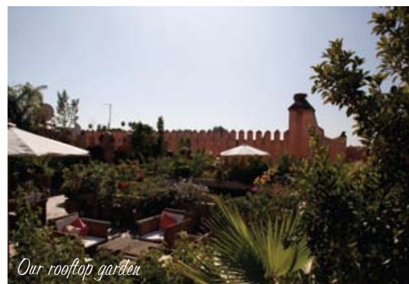
Our rooftop garden

It feels like the heart and pulse of Marrakech lies within the souks; the endless maze of lanes runs through the city like arteries. Tiny shops lure you in with beautiful brass lanterns, pyramids of brightly coloured spices and pointed shoes known as babouches. Be prepared to get lost, it is impossible to navigate your way around these lanes that are constantly branching out - or so it seems - but thankfully you're never more than a few minutes' walk back to Jemaa El Fna.