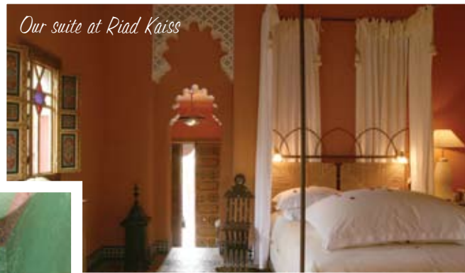
Our suite at Riad Kaiss

The next morning involved a very early start as we were picked up in a Land Cruiser and driven across the desert to experience Marrakech from a different perspective – a hot air balloon. With the Atlas Mountains as a backdrop to the pink washed city being lit up by the sunrise, it was a privilege to witness. For those looking to make it even more special, breakfast for two with Champagne during your balloon ride can be arranged. Having quietly drifted by the Atlas Mountains, our hotel arranged for a car to take us to see them close up. If a personal 4x4 as a mode of transport isn't authentic enough for you, camel treks through the area are easily arranged by tourist companies.