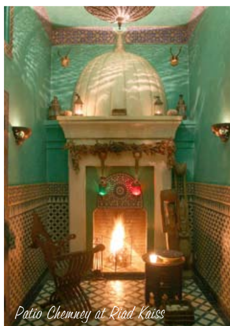
Patio Chemney at Riad Kaiss

The next morning involved a very early start as we were picked up in a Land Cruiser and driven across the desert to experience Marrakech from a different perspective – a hot air balloon. With the Atlas Mountains as a backdrop to the pink washed city being lit up by the sunrise, it was a privilege to witness. For those looking to make it even more special, breakfast for two with Champagne during your balloon ride can be arranged. Having quietly drifted by the Atlas Mountains, our hotel arranged for a car to take us to see them close up. If a personal 4x4 as a mode of transport isn't authentic enough for you, camel treks through the area are easily arranged by tourist companies.