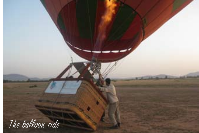
The balloon ride