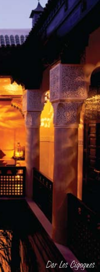
Dar Les Cigognes